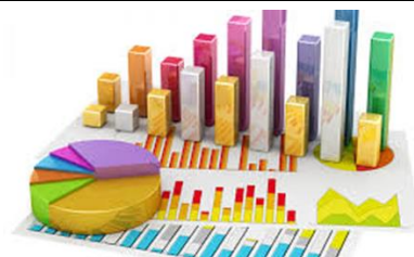
facts and statistics