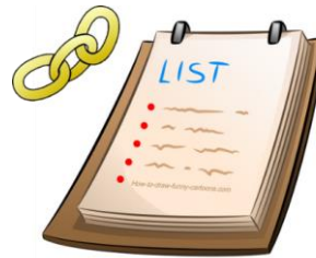
link to list of reasons