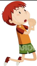
summary of what you would like