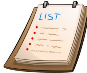
list of reasons