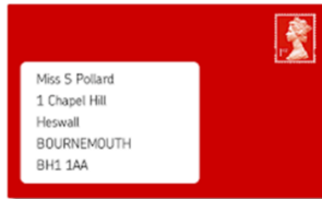
who the letter is to