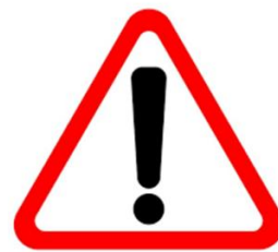
what the issue/problem is