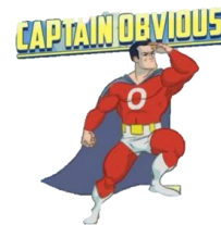
most obvious reason