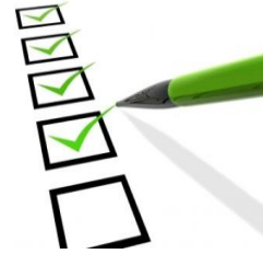
proof that you meet the criteria