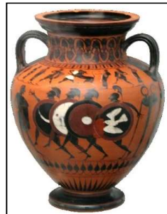
Running in armour