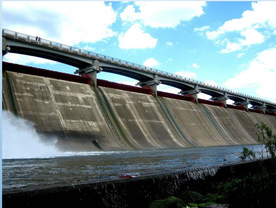
The Hoover Dam on the Colorado River in the USA.