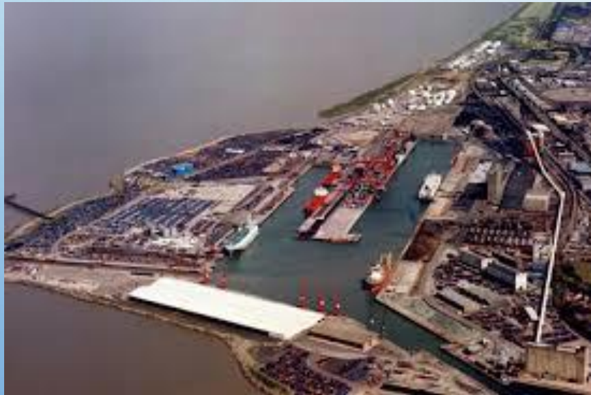
Avonmouth Docks at the mouth of the River Avon.

Lots of major towns and cities have grown up around rivers because they use the river to import (bring in) and export (send out) goods from all over the world.