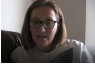
Chapter 26 - The Apology