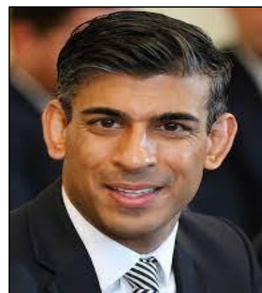
Our Prime Minister is Rishi Sunak.

He leads a team of Ministers who help run the country. Different ministers are responsible for different things like transport, education or the environment. Every week, the Prime Minister comes to the House of Commons to answer questions from MPs about the work of the Government. There will be a general election before the end of the year, in which we will vote for a new Prime Minister. What qualities do you think a person needs to make a good Prime Minister? Create a 'Wanted' poster to show these, like the astronaut example to the left.